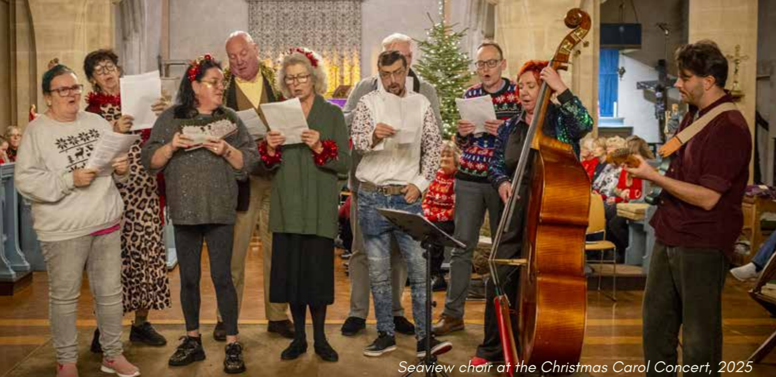
Seaview choir at the Christmas Carol Concert, 2025