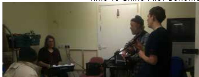
Music group, 2014