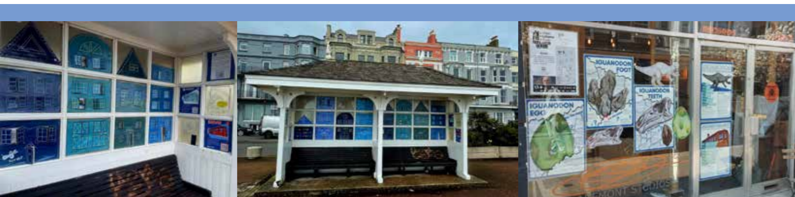
Photographs from A Town Explores a Book, 2023 and 2024