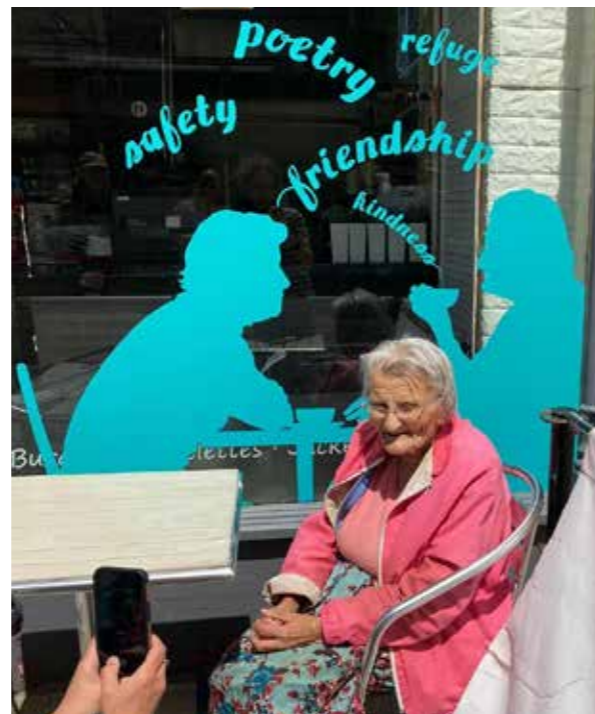
Photographs from Now You See Me, 2022