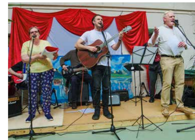
Seaview band at SGT, 2025

isn't just about playing or performing. Music at Seaview is about wellbeing and connection. It is well documented listening, creating and participating in music, has powerful wellbeing benefits. Music can reduce stress and anxiety, enhance mood and positivity, and at Seaview we see how music can build a sense of belonging and community. Whether someone has never touched an instrument, lives with a disability, struggles with communication, or is simply curious; every voice matters, and every contribution is welcomed.