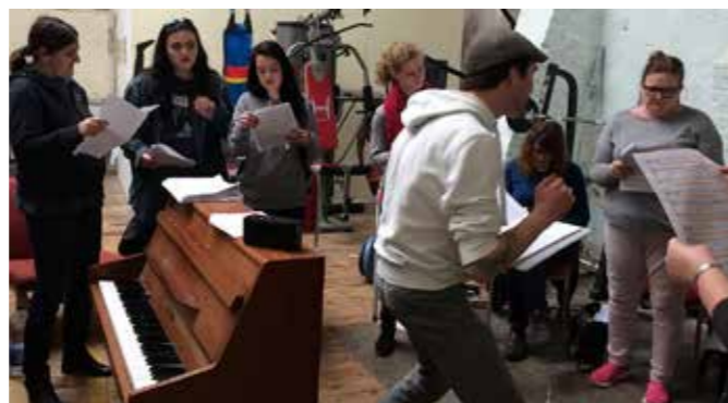
Time To Shine Pilot Scheme

Over the last 40 years, Seaview has seen music take centre stage at many of our events. From Time to Shine leading 12 weeks of rehearsals culminating in a moving and uplifting performance at the St Leonards on Sea Masonic Hall. To the Seaview Choir participating in performances with Barefoot Opera at various community opera performances at St Marys in the Castle, St John the Evangelist Church; performing at Seaview Projects Seaview's Got Talent through to headlining the Seaview annual Carol Concert. Not forgetting the Seaview bands Dusty Lilacs expressing their stories through songwriting and opening for the Sidley Festival. Now, excitingly, we have a new band practicing at Seaview called Monsat Inc. While Monsat Inc are a relatively new peer led band, they opened at the Big Sleep LIVE this year and will also be seen performing at Seaview's Got Talent on the 22nd April.