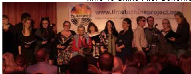
Time To Shine Pilot Scheme