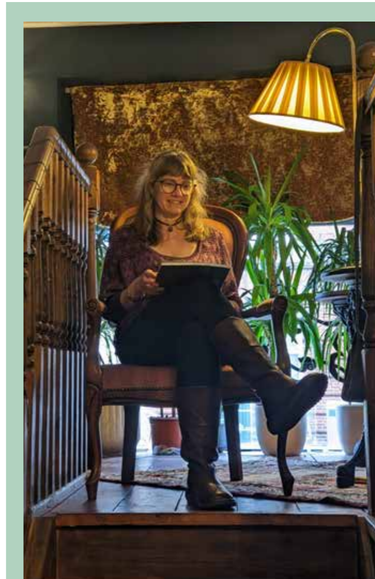
Barnaby's Lounge, 46 Robertson Street, Hastings TN34 1HL

An enthusiastic gathering of curious minds and open hearts came along with their art and writing