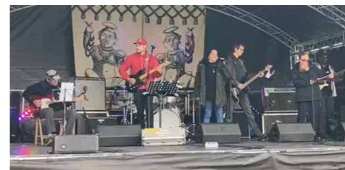
Dusty Lilacs at Sidley Festival, 2024

Alongside introducing and enhancing new musical skills, encouraging belief in self and confidence, music at Seaview