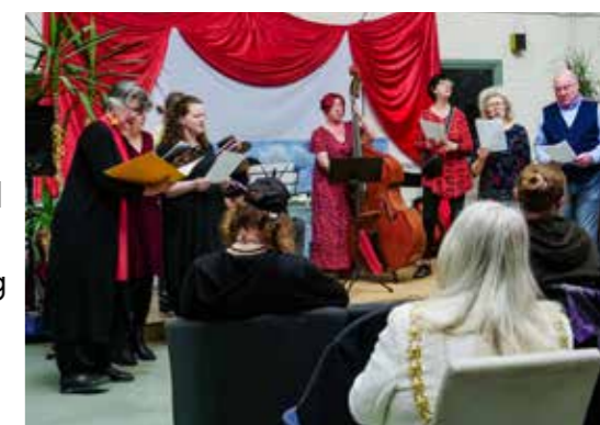
Seaview choir at SGT, 2025

Alongside introducing and enhancing new musical skills, encouraging belief in self and confidence, music at Seaview